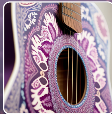
Wood & Plastics